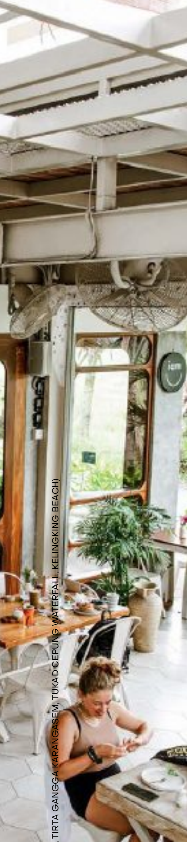
IMAGES: SHUTTERSTOCK (BALINESE DANCE, TIRTA GANGGA, KARANGASEM, TUKAD CEPUNG WATERFALL, KELINGKING BEACH)