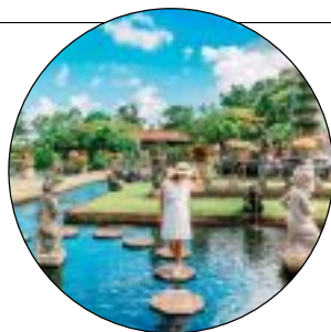
Tirta Gangga, Karangasem

Level up your social feed with these beautiful Bali backdrops