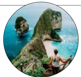
Kelingking Beach, Nusa Penida