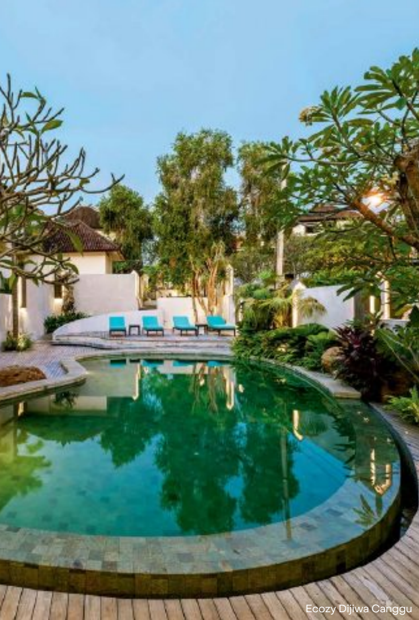
Eoozy Dijiwa Canggu