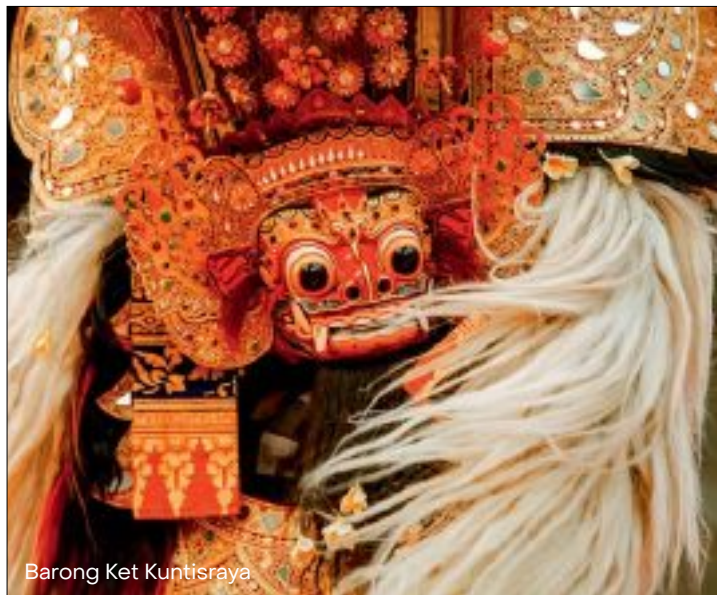
Barong Ket Kuntisraya

Beyond technical prowess, the charisma, humility and spiritual energy of the dancers is what pulls you into the performance.