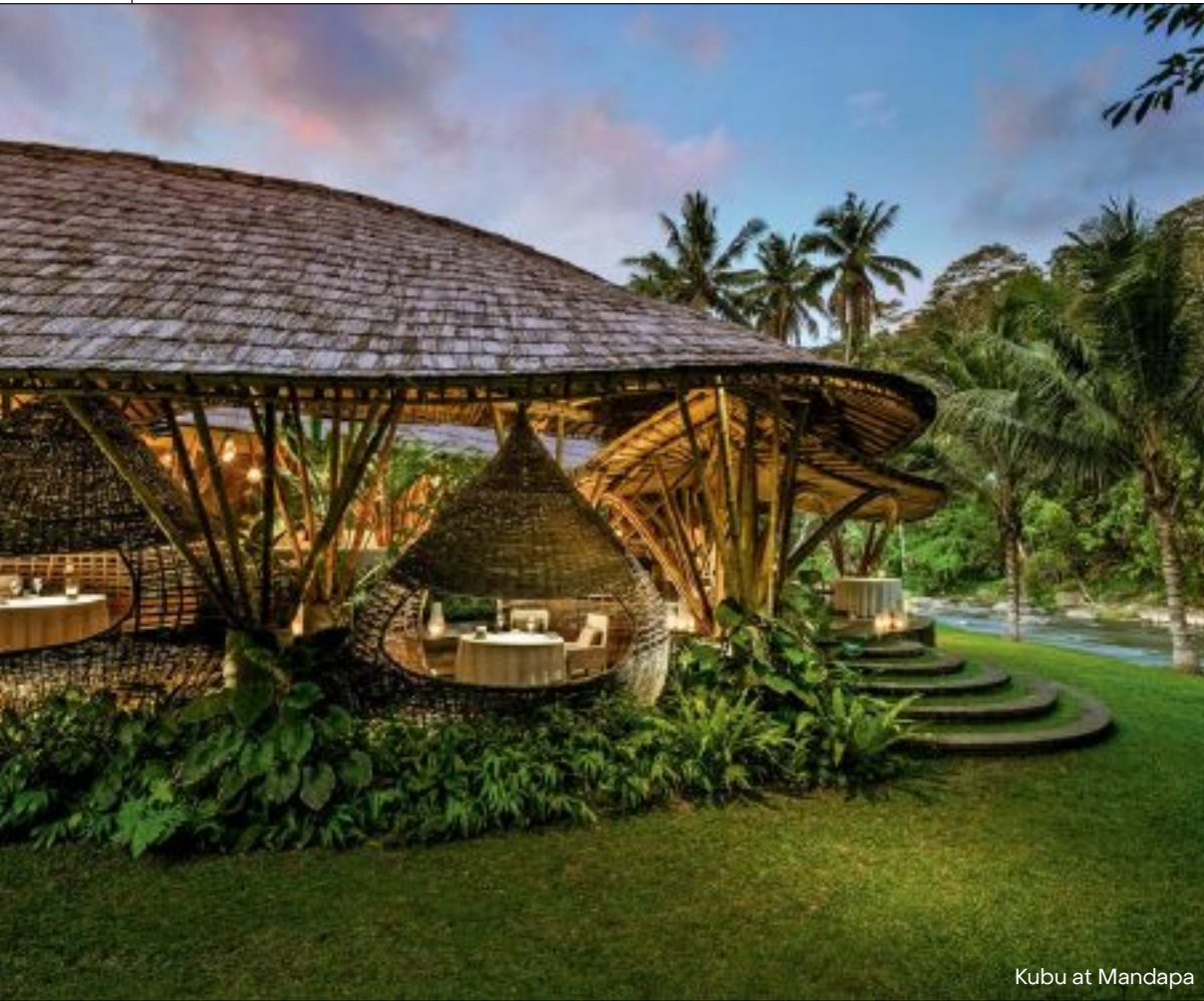
Kubu at Mandapa

Eating out runs cheap in Bali, but here is where to book a table when you are craving something extra special