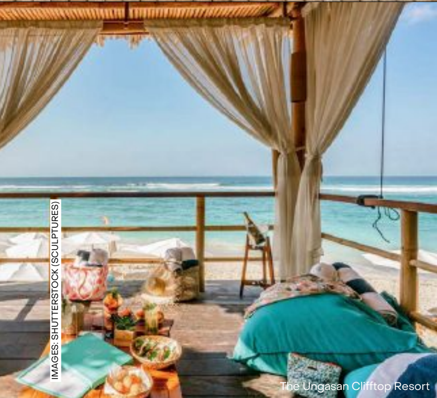
The Ungasan Clifftop Resort