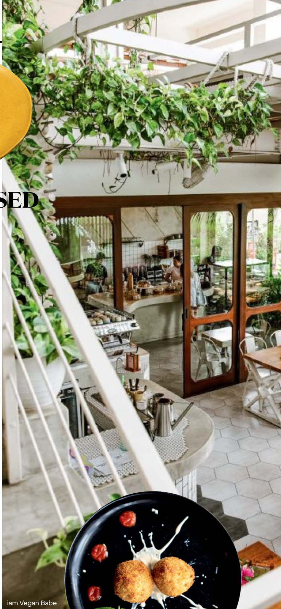
iam Vegan Babe